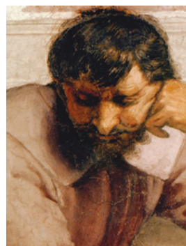
Michelangelo Buonarroti: Mikey was expelled for sneaking a chisel on campus.