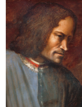
Lorenzo the Magnificent: To his girlfriends, just Larry the So-So.