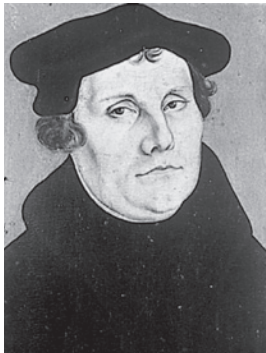
Marty Luther: Voted Most Likely to Secede.

fellow Florentine Leonardo da Vinci in a painting contest. Leonardo spent time with the writer Niccolò Machiavelli, whose name has become synonymous with political maneuvering. Machiavelli was an advisor to Lorenzo the Magnificent. Lorenzo's son became Pope Leo X, who hired the painter Raphael. Raphael exchanged masterpieces with Albrecht Dürer in Germany. Dürer was personally converted to Protestantism by Martin Luther...who was excommunicated by Leo X...who had gone to school with Michelangelo. There were 100 million people in Europe back then, but it was a small world.