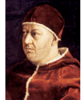
Pope Leo X: tried to get Marty Luther expelled.