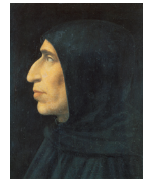
Savonarola: The school killjoy, ultimately hung and burned by his classmates.