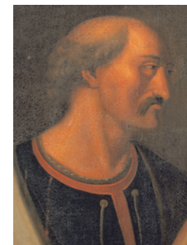
Amerigo Vespucci: Biggest ego—graffitied his name everywhere.